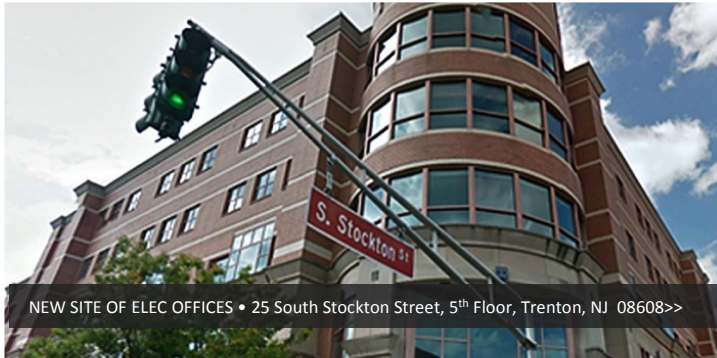
NEW SITE OF ELEC OFFICES • 25 South Stockton Street, 5 th Floor, Trenton, NJ 08608>>

Home | Public Information | Candidates/Committees | Lobbying | Pay-to-Play | Legal Resources | About ELEC