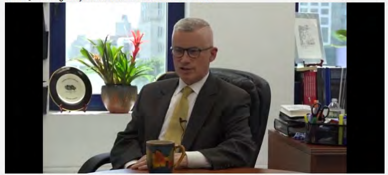
Volume 9 – Jim McGreevey Interview. Former NJ Governor 2002 – 2004