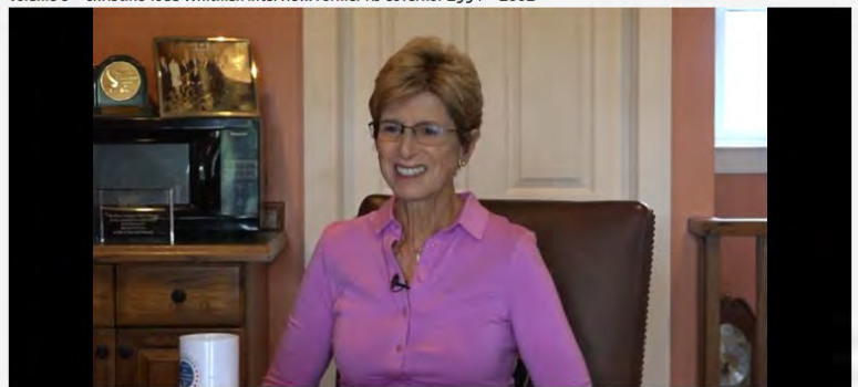
Volume 8 – Christine Todd Whitman Interview. Former NJ Governor 1994 – 2001

As such, I proudly submit the Commission’s Annual Report to the Legislature.